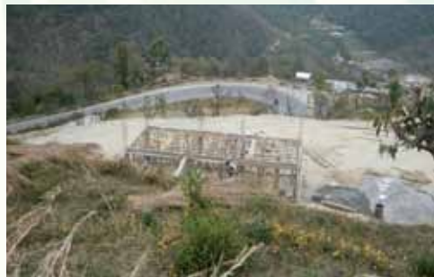
Fulbari Resource Centre -Under construction

"We should not wholly blame the teenagers for getting into the difficulties in which so many of them find themselves today. We should look to their parents, and the parents' parents and their teachers." - Only Love, Sri Sri Daya Mata